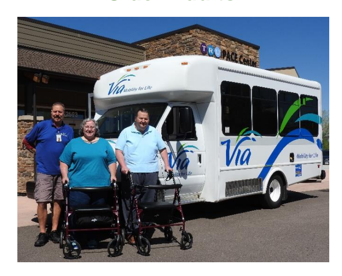
Photograph highlights partnership between TRU Community Care and VIA Mobility Services